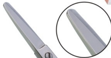
SI-1002 Baby Scissor (Straight / Curved) 8cm