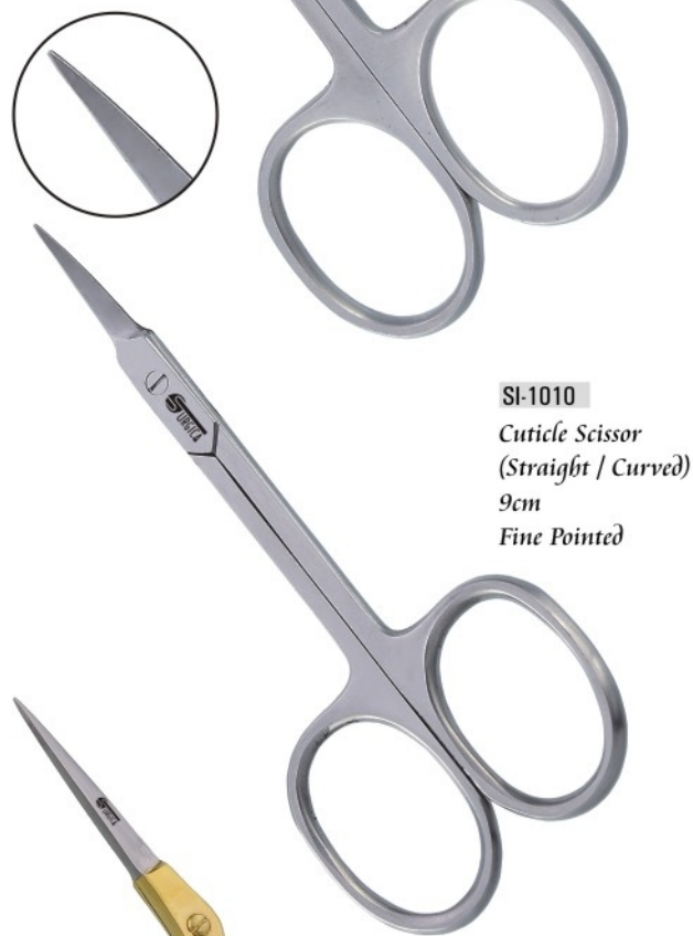
SI-1010 Cuticle Scissor (Straight / Curved) 9cm Fine Pointed