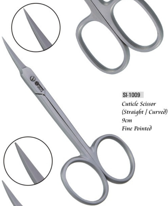
SI-1009 Cuticle Scissor (Straight / Curved) 9cm Fine Pointed