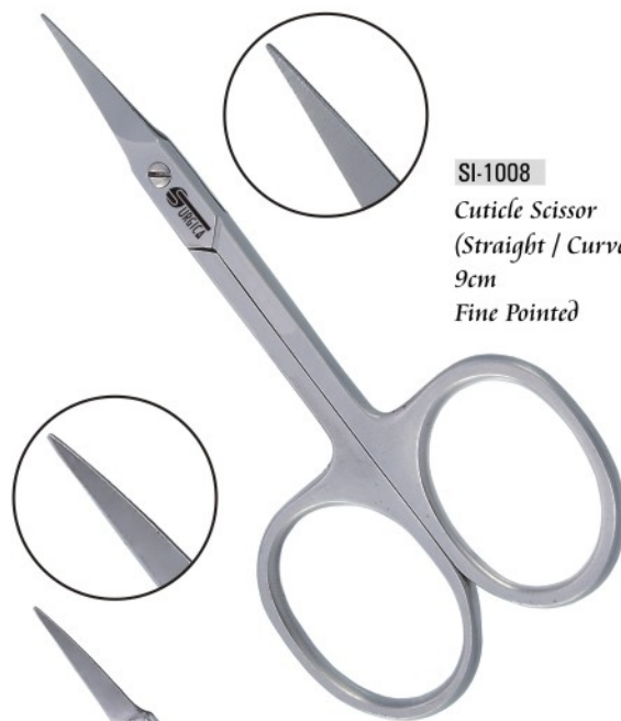
SI-1008 Cuticle Scissor (Straight / Curved) 9cm Fine Pointed