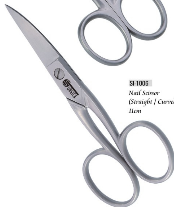
SI-1006 Nail Scissor (Straight / Curved) 11cm