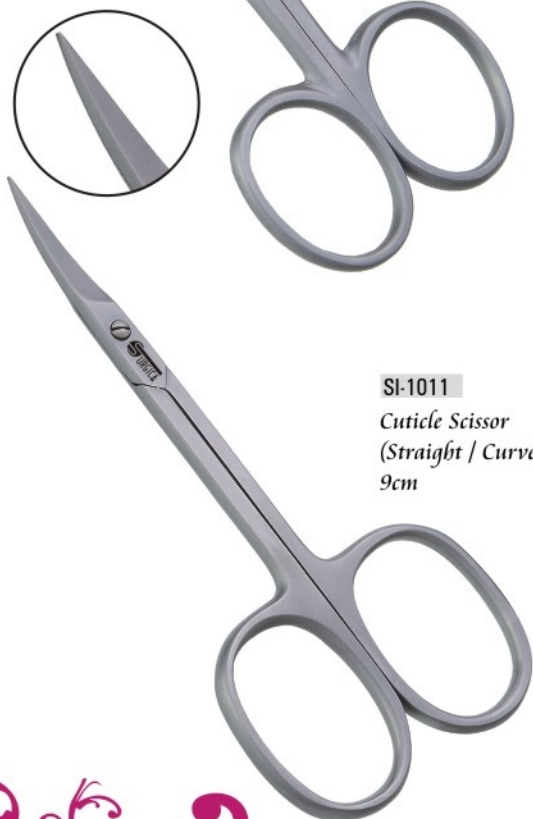
SI-1011 Cuticle Scissor (Straight / Curved) 9cm