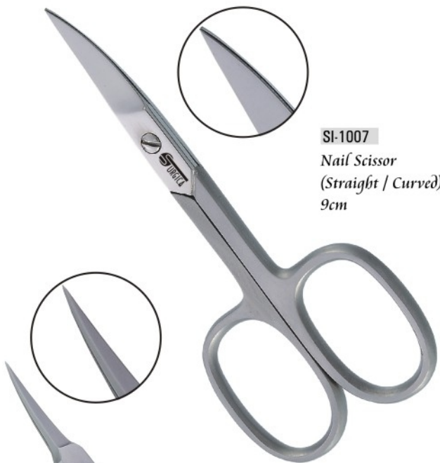
SI-1007 Nail Scissor (Straight / Curved) 9cm