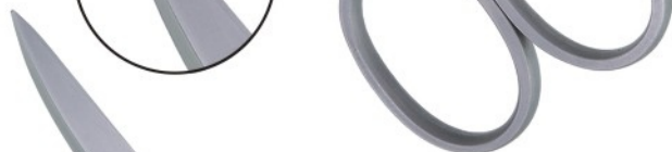
SI-1003 Nail Scissor (Straight / Curved) 9cm