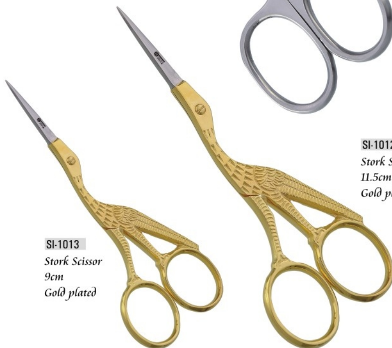
SI-1013 Stork Scissor 9cm Gold plated