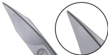
SI-1001 Nail Scissor (Straight / Curved) 10.5cm