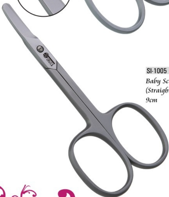
SI-1005 Baby Scissor (Straight / Curved) 9cm